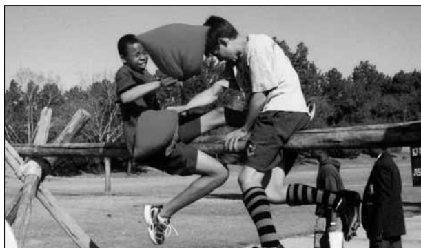
Form I Sports Day.