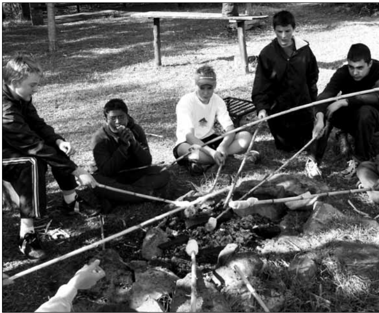
Stokbrood and syrup for breakfast.