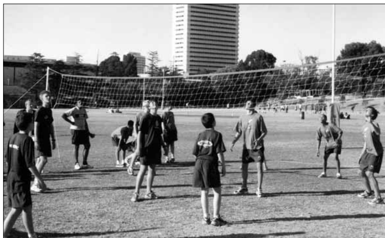
Form I Sports Day.