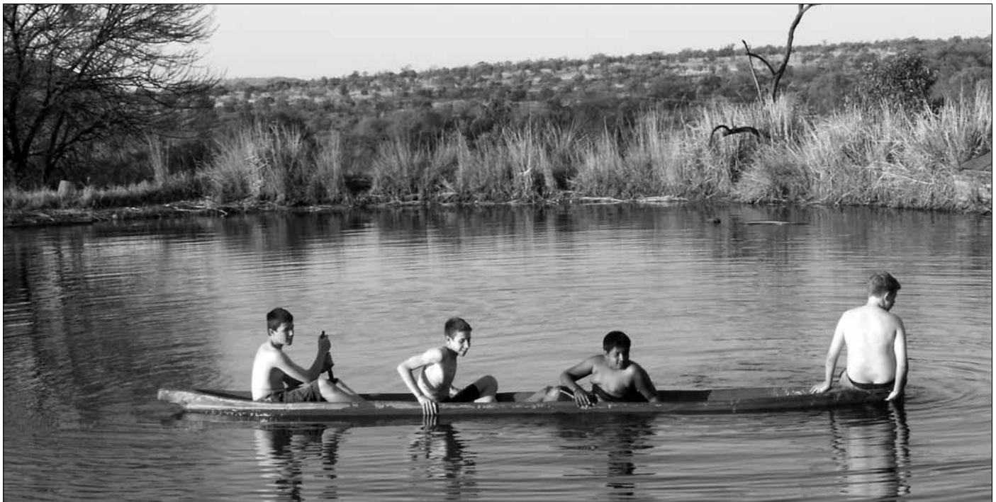
The Junior Monitors testing their rowing skills.