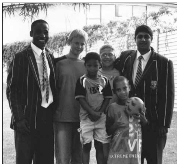
Delivering stationery to Bramley Children’s Home.